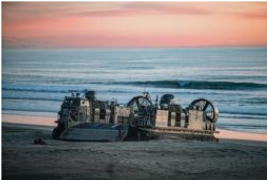
BY LAND AND SEA

U.S. Marines with the 24th Marine Expeditionary Unit (MEU) disembark a Navy landing craft, air cushioned, during Amphibious Squadron, MEU Integration (PMINT) on Camp Lejeune, North Carolina, Dec. 12, 2023. PMINT is the 24th MEU's first opportunity in the pre-deployment training cycle to fully integrate with the Wasp Amphibious Ready Group. During PMINT, the Marines and Sailors are tested across required operational capabilities and projected operating environments through a variety of simulated and live events.