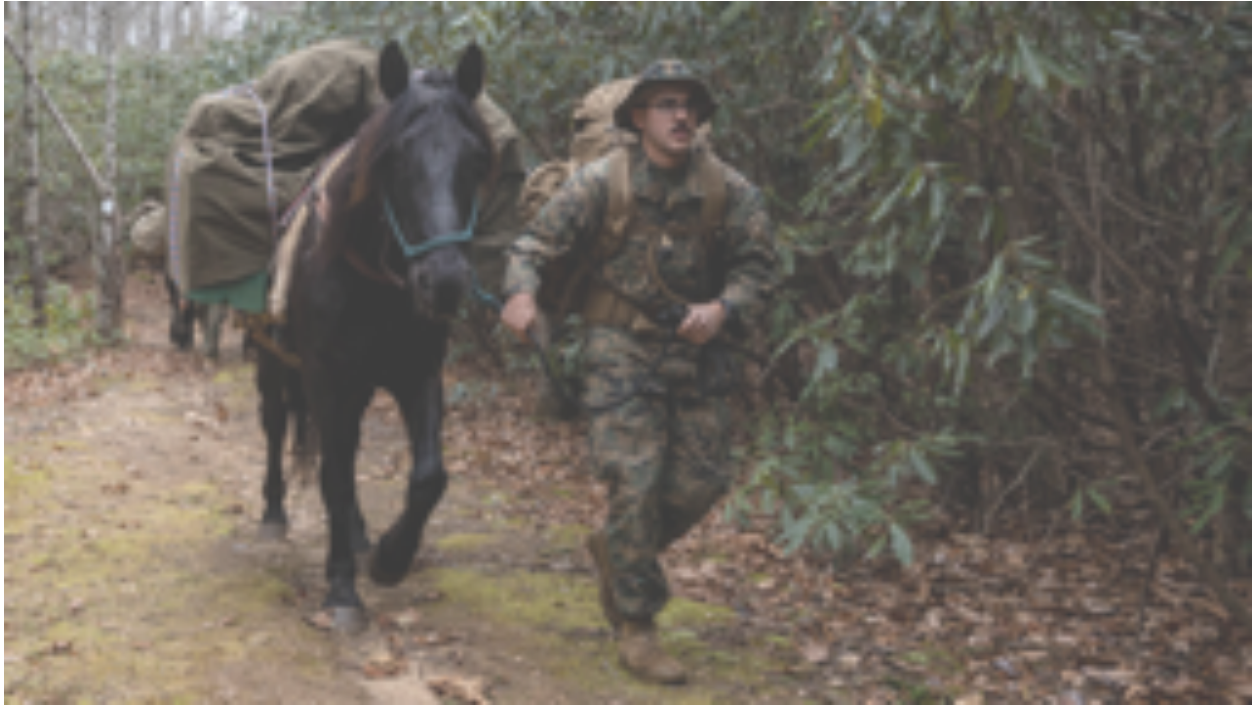
2nd Marine Logistics Group Camp LeJeune, NC, UNITED STATES 11.15.2023