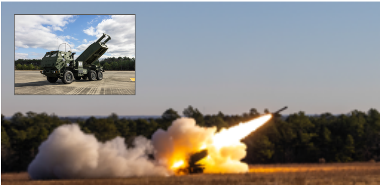
2nd Marine Division Camp LeJeune, NC, UNITED STATES 12.12.2023