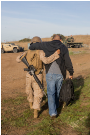
1st Marine Division Camp Pendleton CA, 12.01.2023