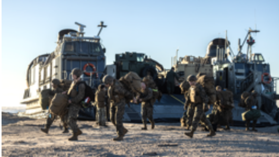
Camp Lejeune, North Carolina 24th Marine Expeditionary Unit, 12.12.2023

U.S. Marines with the 24th Marine Expeditionary Unit (MEU) disembark a Navy landing craft, air cushioned, during Amphibious Squadron, MEU Integration (PMINT) on Camp Lejeune, North Carolina, Dec. 12, 2023. PMINT is the 24th MEU's first opportunity in the pre-deployment training cycle to fully integrate with the Wasp Amphibious Ready Group. During PMINT, the Marines and Sailors are tested across required operational capabilities and projected operating environments through a variety of simulated and live events.