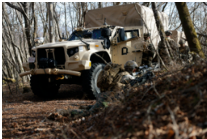
Combined Arms Training Center Camp Fuji, SHIZUOKA, JAPAN 12.04.2023

U.S. Marines with 2d Battalion, 7th Marine Regiment execute a resupply during Stand-in Force Exercise 24 at Combined Arms Training Center Camp Fuji, Japan, Dec. 4, 2023. SIFEX 24 is a division-level exercise involving all elements of the Marine Air-Ground Task Force focused on strengthening multi-domain awareness, maneuver, and fires across a distributed maritime environment. This exercise serves as a rehearsal for rapidly projecting combat power in defense of allies and partners in the region. 2/7 is forward deployed in the Indo-Pacific under 4th Marine Regiment, 3d Marine Division as part of the Unit Deployment Program.